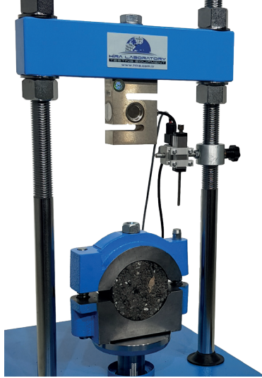
HR-AS0500/1 & HR-G0981 HR-G0995 & HR-AS5000/1