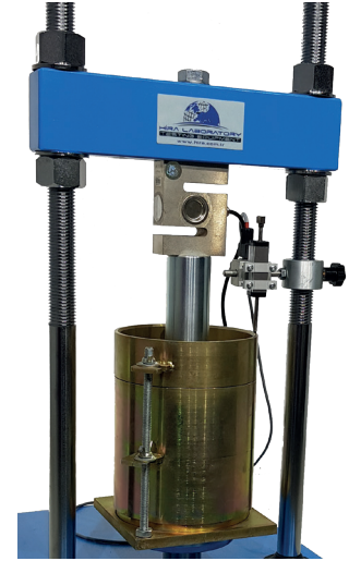
HR-AS0500/1 & HR-G0981 HR-G0995 & HR-S5000/1 HR-S5100