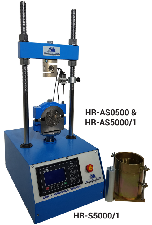
HR-AS0500 & HR-AS5000/1