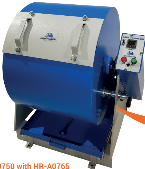
HR-A0750 with HR-A0765