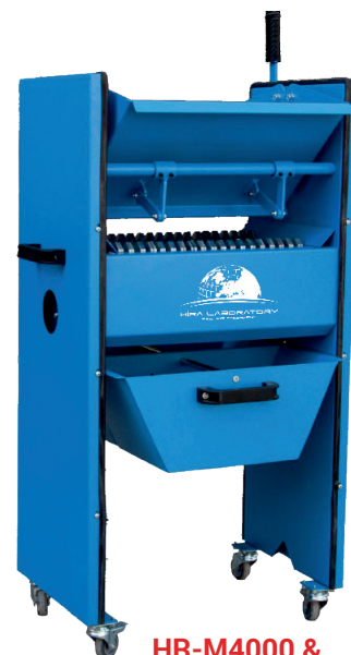
HR-M4000 & HR-M4000/1

Wheels are available as an option and should be ordered separately.