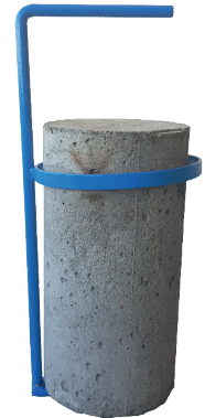
HR-C0249 with sample