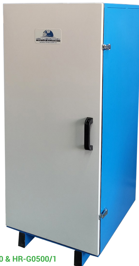
HR-G0500 & HR-G0500/1