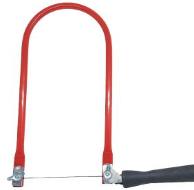
HR-G0753 WITH HR-G0754